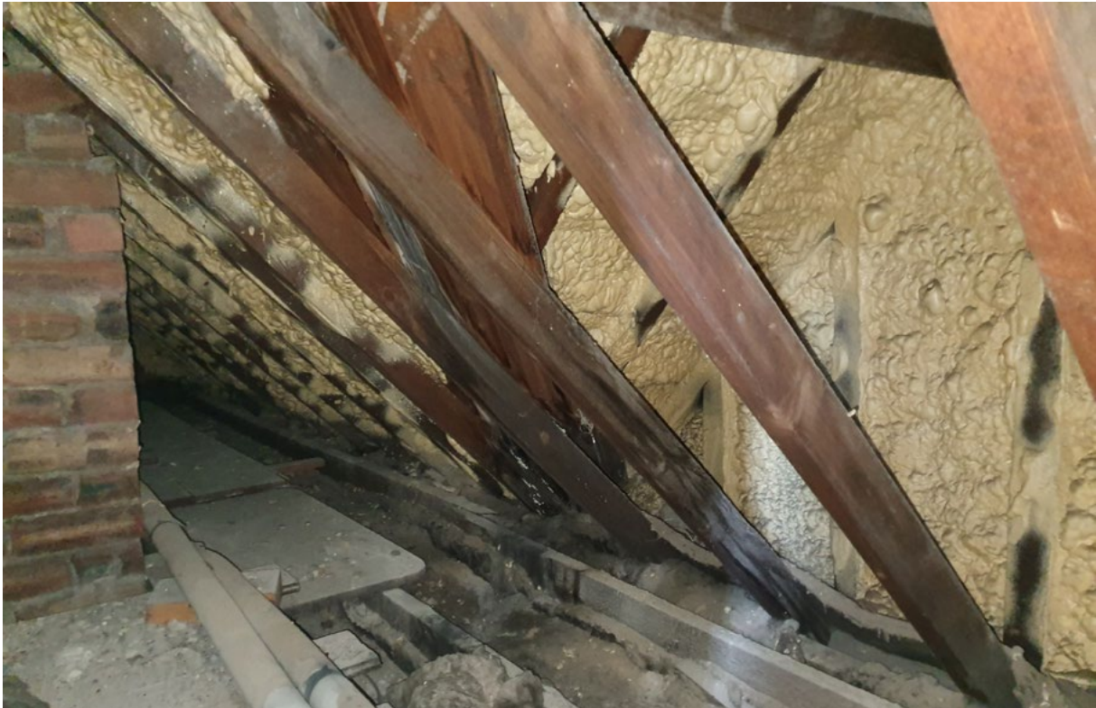
Figure 4: Example of spray foam incorrectly installed leading to condensation problems

RICS advises homeowners to seek independent expertise, commercially separated from the installer and manufacturer, to advise if spray foam is appropriate for their property. See the section Installing spray foam insulation in your home for more detail.